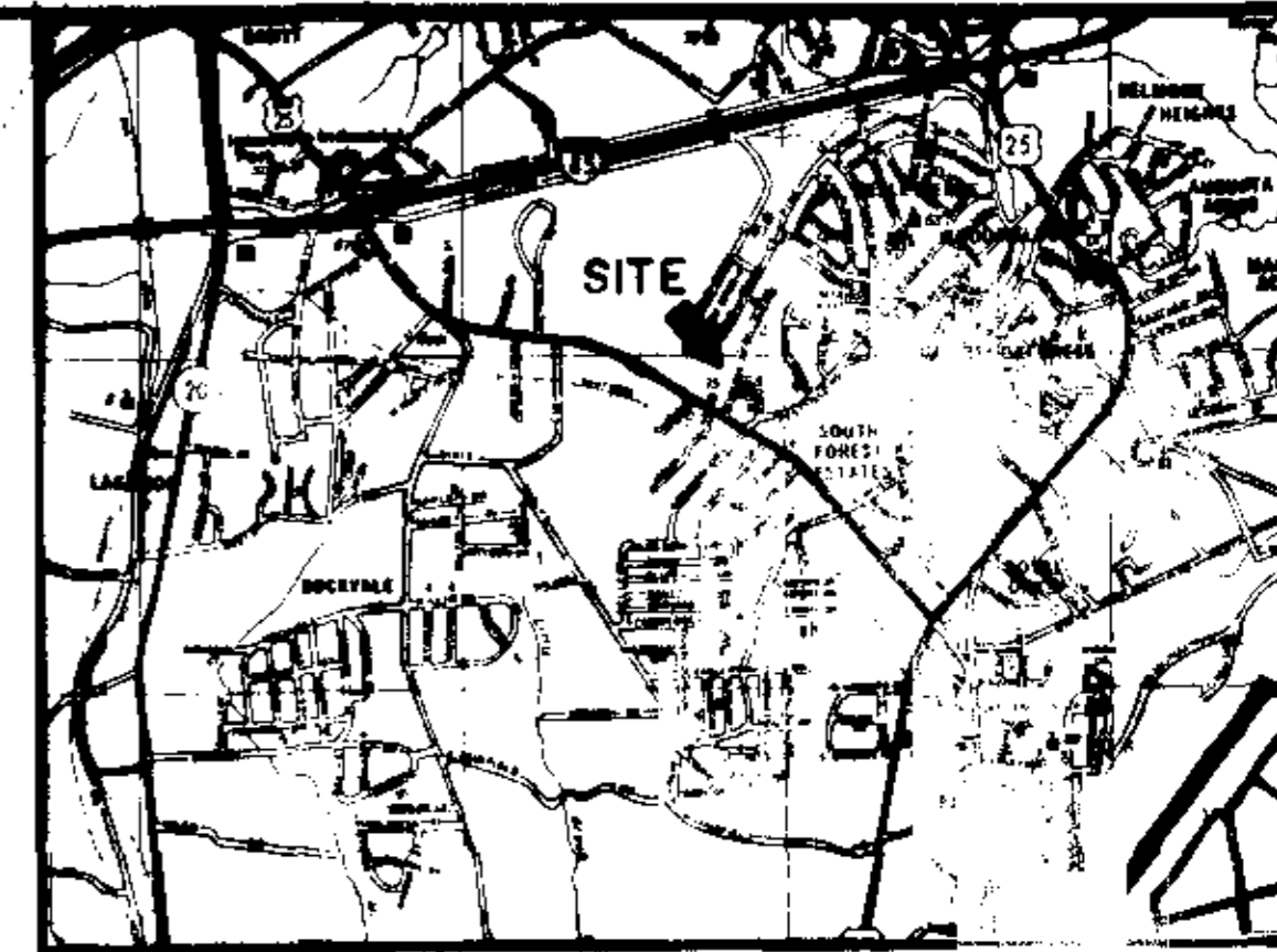
LOCATION MAP (INTS)