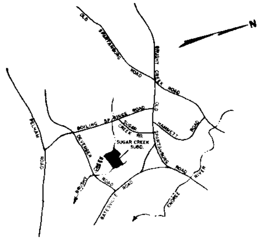
LOCATION MAP N/S