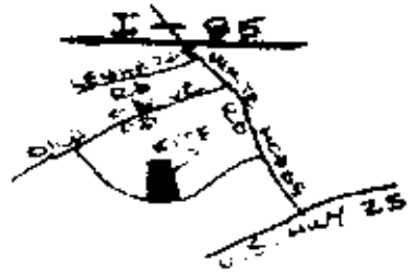
LOCATION MAP NO SCALE

FILED GREENVILLE CO. S. C. OCT 7 4 22 PM '82 DONNIE S. TAMMERSLEIGH R.M.C.