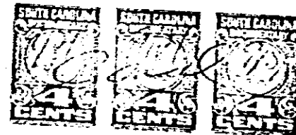
Form No. R19 (South Carolina)