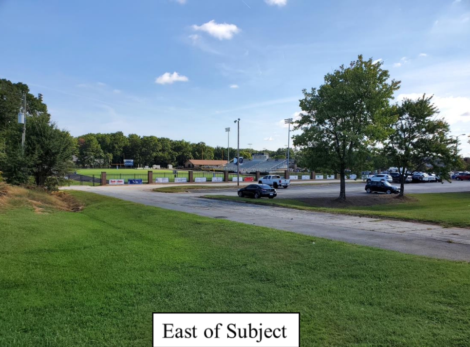
East of Subject