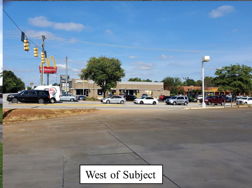
West of Subject