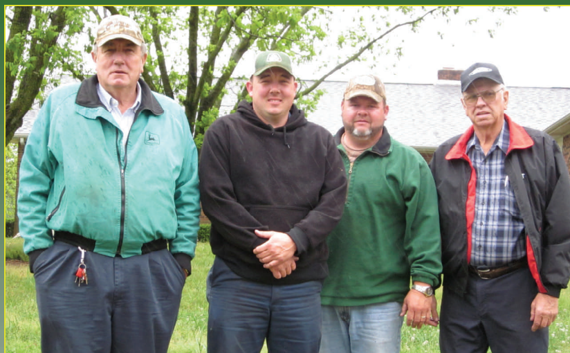
Davis Dairy owners

Davis Dairy began in the mid-1930's as a traditional 50- acre farm, growing cotton and produce. In 1952, the Davis family started a milking operation, using feed grown in their own fields for the dairy cows. The dairy produced raw milk, chocolate milk and homemade butter. The premium products were delivered straight to the customers' doorsteps until 1972. Between 1972 and 1994, Davis Dairy's milk was primarily sold to a wholesale company and distributed throughout the Upstate.