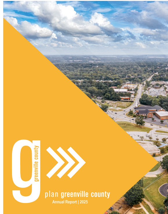
ANNUAL REPORT 2025 DOCUMENT